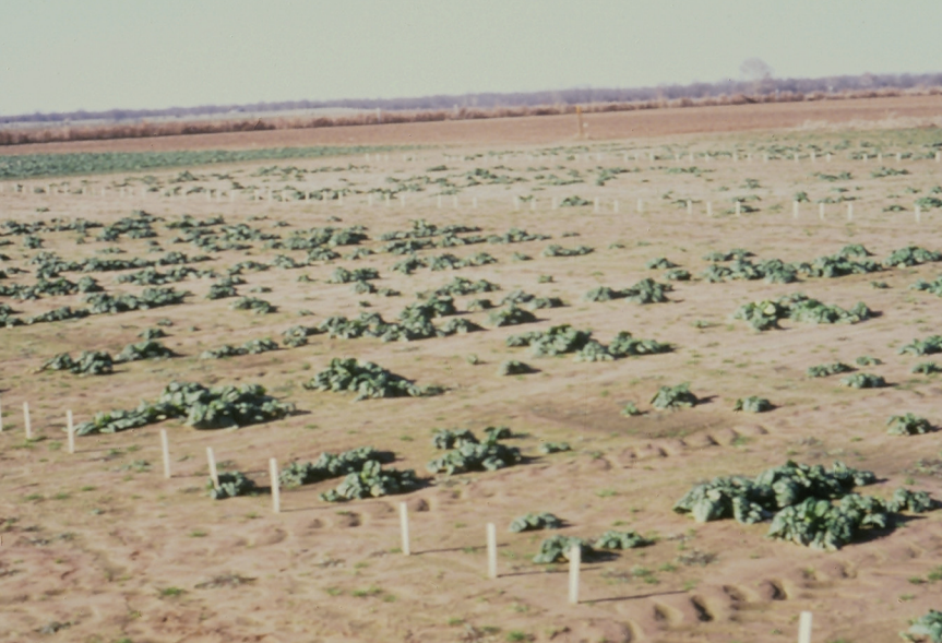
Figure 2, photo by Teddy Morelock, University of Arkansas

thought it would be some spanking new, totally uniform deal. I was totally shocked when I planted the seed out of this commercial packet of spinach 15 years ago and this variation is what I got. I was blown away. I could breed six new varieties of spinach from that one variety.