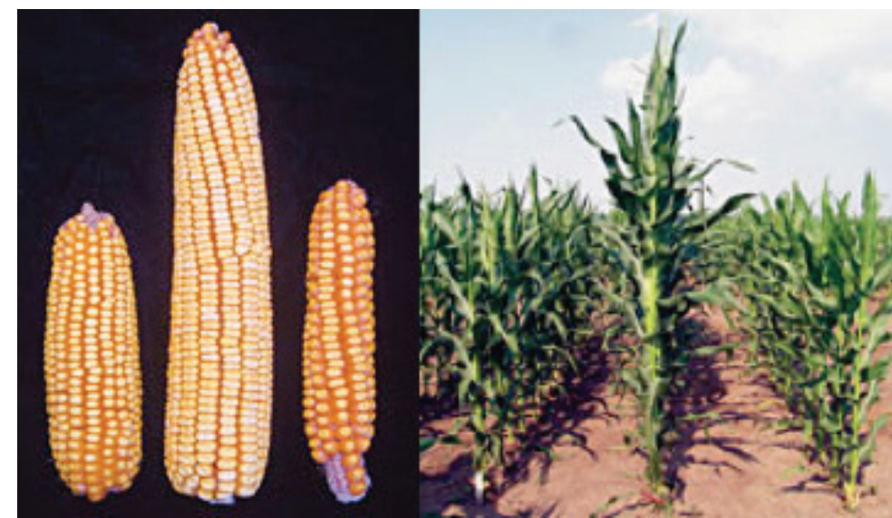
Figure 2, Photo from Iowa State University News Service