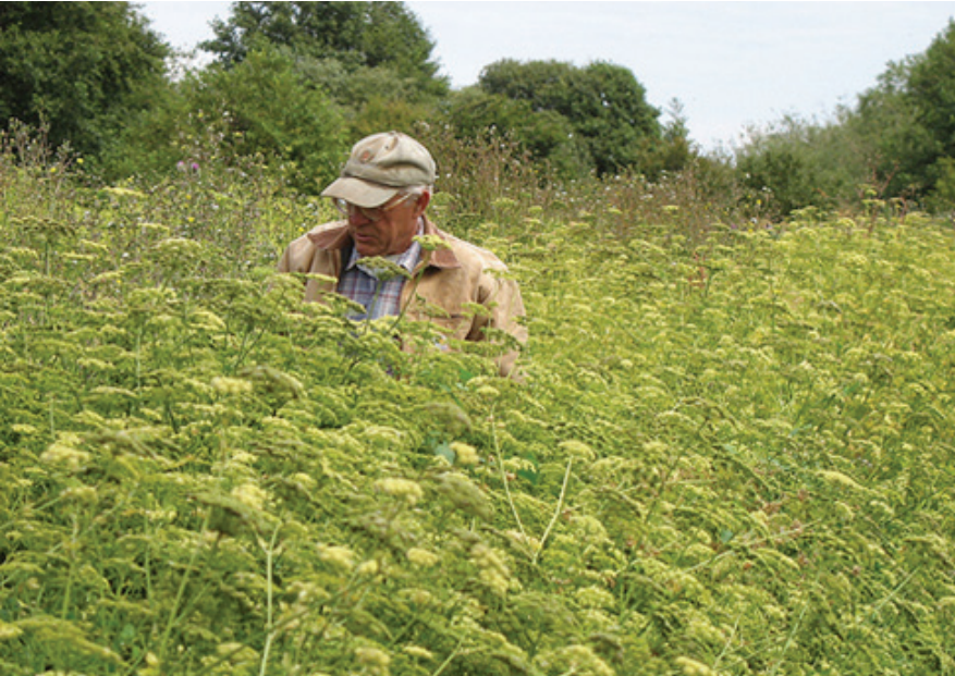
Figure 1, photo by Micaela Colley, Organic Seed Alliance

When I was working at a large seed company, some seeds people from Italy showed up and they said, "We want you to look at our spinach. This is the best spinach in southern Italy. This is what all of the farmers grow." I