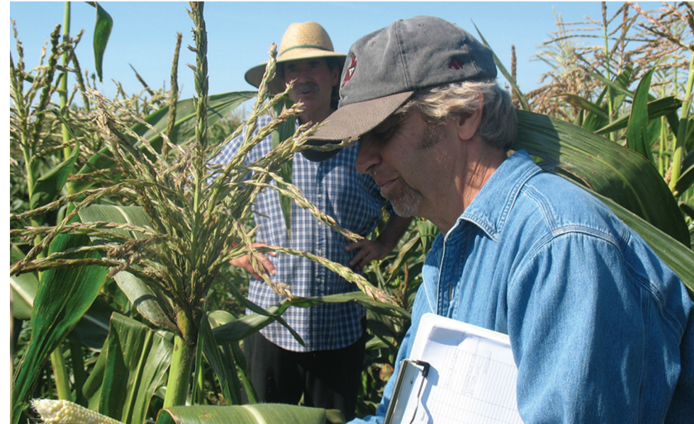
Figure 3, Photo by Jared Zystro